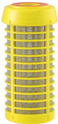
RAH cartridge 90 micron stainless steel net AISI 316