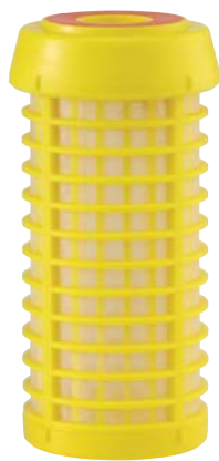
RLH cartridge 90 micron polyester net