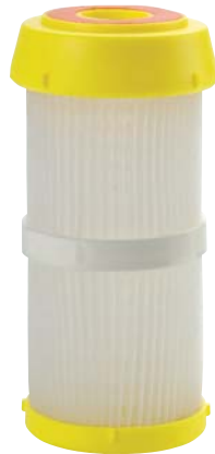
RSH cartridge 50 micron pleated polypropylene net