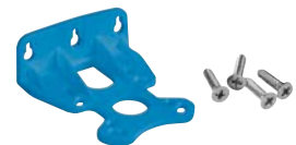
-S- wall bracket wall bracket screws