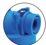
IN female plastic in/out threads 1/2", 3/4", 1", 1 1/4, 1 1/2